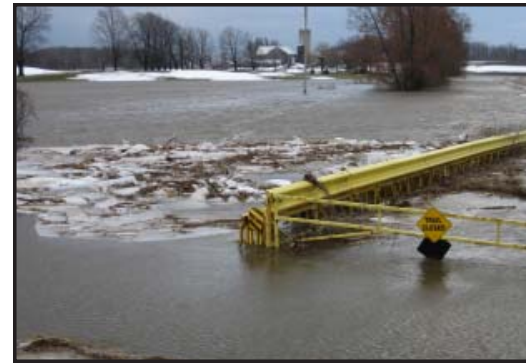
East of Molesworth, December 28, 2008.