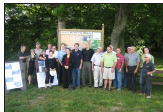
Tour of the Scott Project for elected officials.