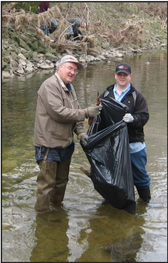
Volunteers at the River Clean Up event, April 25, 2009 in Listowel. This event was sponsored by the Middle Maitland Rejuvenation Committee.