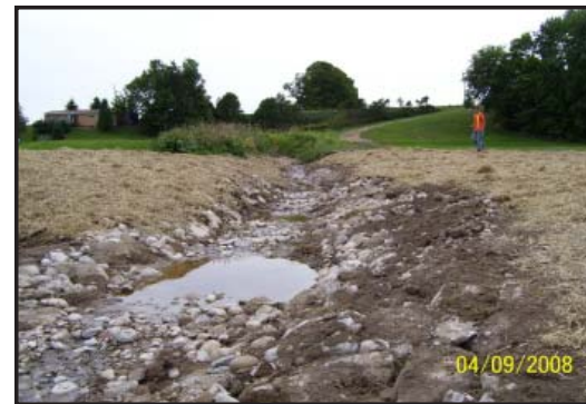
Daw erosion control project in North Huron.