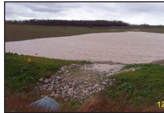
Following an intense rain at the Steenstra Project.