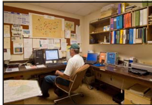
Flood services area at the MVCA office, Wroxeter.