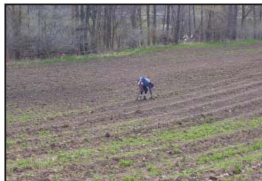
2008 tree seedlings planting site.