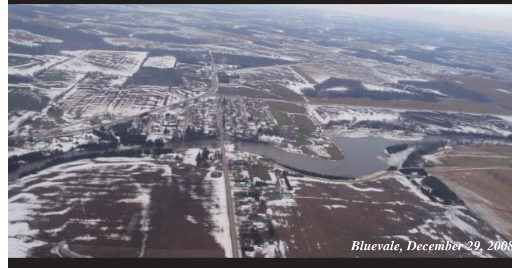
Bluevale, December 29, 2008