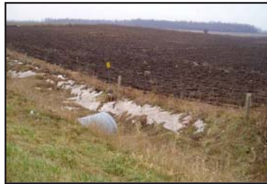
Steenstra Demonstration Project - Before

Integration of MVCA's Development Regulation with Municipal Land-use Planning Policies and Bylaws - Staff are continuing to work with municipalities to identify ways to integrate and coordinate the permit process for landowners. This will help to reduce time and costs for both landowners, municipalities and the Conservation Authority.