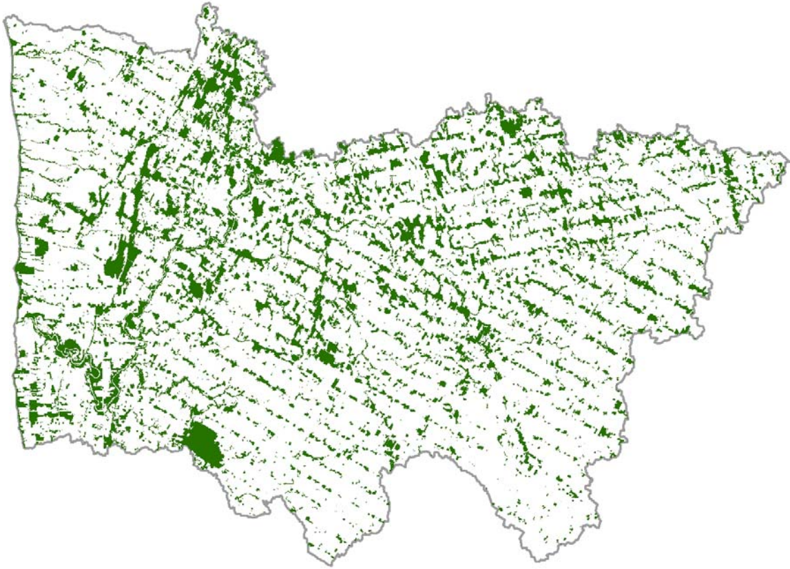
Existing Natural Cover in the MVCA