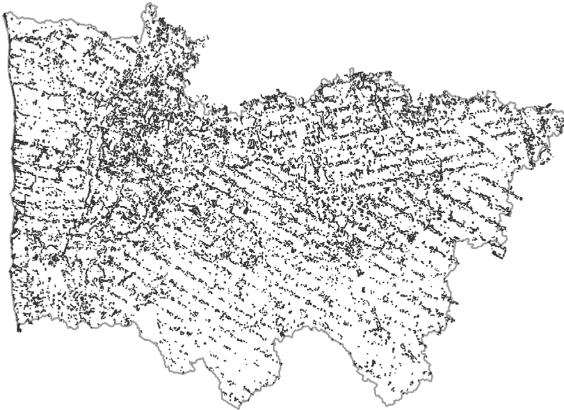
Forest Loss Between 1985-1999