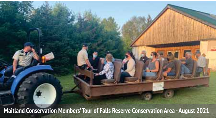
Maitland Conservation Members' Tour of Falls Reserve Conservation Area - August 2021