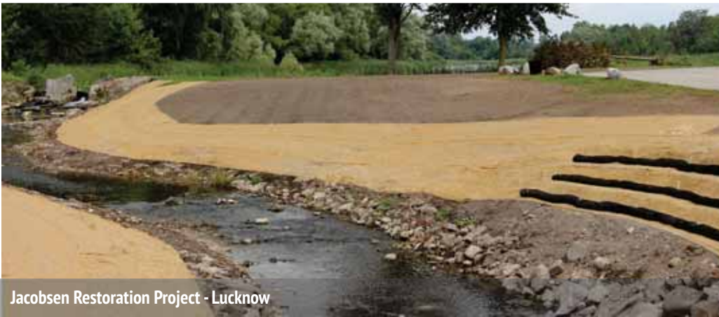
Jacobsen Restoration Project - Lucknow