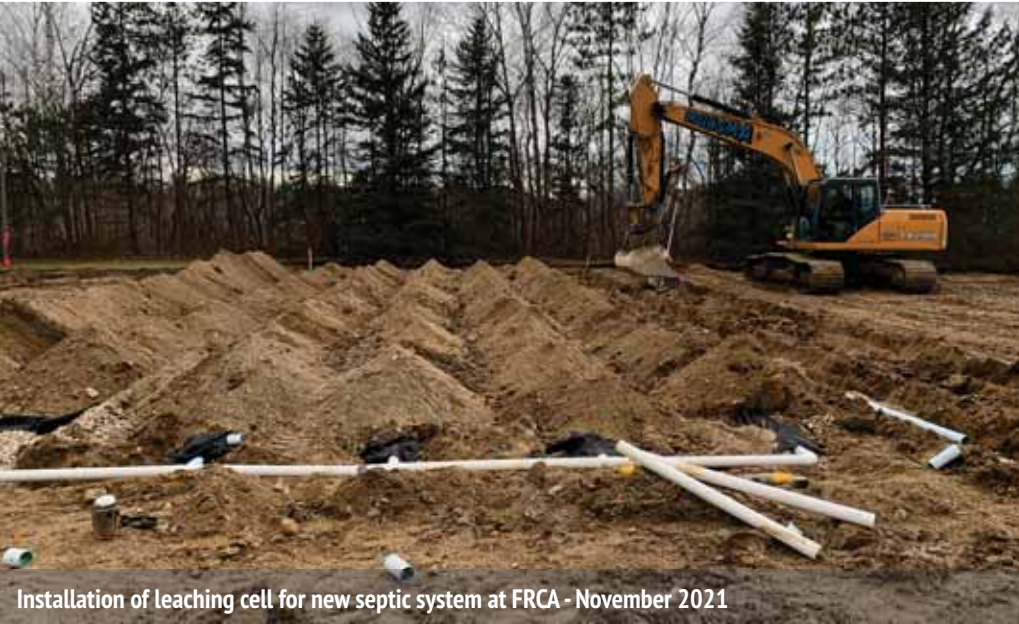
Installation of leaching cell for new septic system at FRCA - November 2021