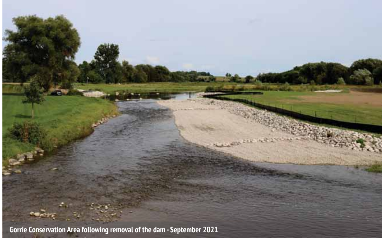
Gorrie Conservation Area following removal of the dam - September 2021